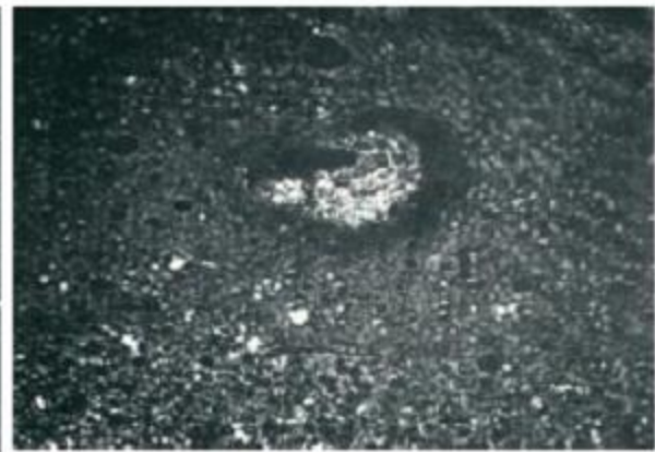
Fig. b: Soot particles in rubber. Interference fringes round the inclusion show that the rubber has undergone mechanical change here. Frequency: 400 MHz Image width: 1mm