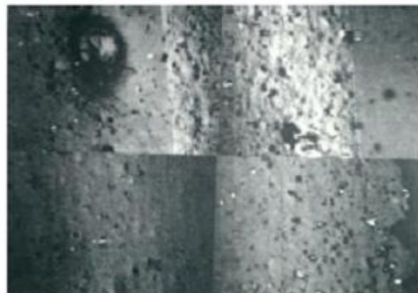
Fig. c: Composite illustration of a cross section of rubber about 2 mm wide (arranged in lines from left to right). The rubber consisted of several different rubber mixtures. Frequency: 400MHz